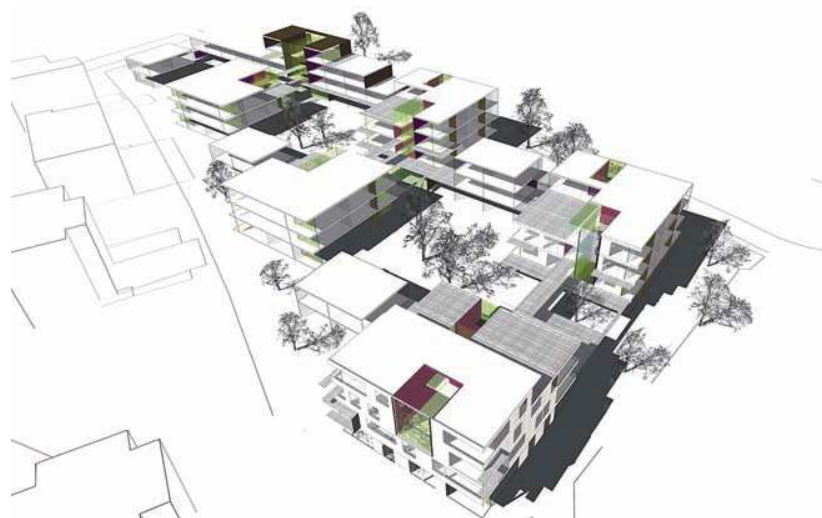
Fig. 7 Project Sieglanger in Innsbruck