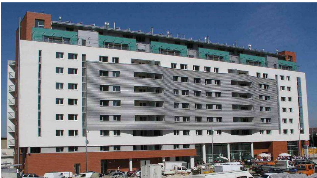
Fig. 6 Project Wienerberg City

The 9 floors residential building in Vienna with 97 apartments was finished in 2003. The load bearing structure is reinforced concrete with clay block masonry as infill; the 2 top floors are monolithic load bearing clay block masonry. The thermal insulation is 25 cm mineral wool; the façade is partly aluminium, partly mineral render and partly clay tiles. The U-value of the external walls is 0.14 \text{ W/m}^2\text{K} , the energy need for heating is 14.8 \text{ kWh/m}^2\text{a} . The building is equipped with a controlled ventilation system with heat recovery; each apartment has its own system. The remaining energy need is covered by district heating. The TQ assessment resulted in a value of 3.44 points, positive were especially the planning quality, safety and longevity.