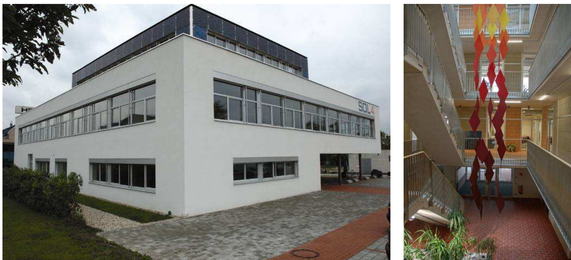
Fig. 1 Project SOL4 in Mödling

and protecting the office spaces from excessive solar gains. In addition, unfired loam bricks were used for the first time as interior office walls. A specialist on construction biology and chemistry was involved to ensure a minimised negative impact of the finishing materials in terms of health and environmental costs.