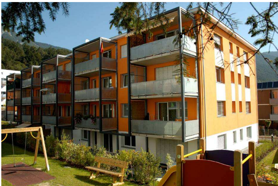
Fig. 5 Project Telfs Puite

Two 4 storey apartment buildings with together 36 apartments in a big residential development project in Telfs in The Tyrol were finished in 2004. The external walls are cavity walls with 2 layers of clay blocks and 22 cm mineral wool insulation. The U-value of the external walls is 0.16 \text{ W/m}^2\text{K} , the energy need for heating is 14.4 \text{ kWh/m}^2\text{a} . The remaining energy need is provided by small gas radiators. The TQ assessment resulted in a value of 3.78 points, especially positive are the planning quality and the longevity.