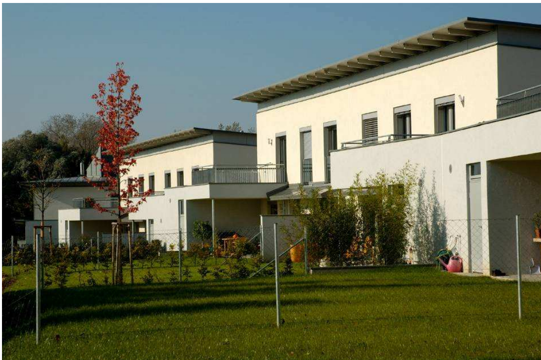
Fig. 3 Project Linz Hamoder

12 semi-detached houses in Linz have been finished in 2005. The external walls are cavity walls with 2 layers of clay blocks and 24 cm mineral wool insulation. The U-value of the external walls is 0,15 W/m 2 K, the energy need for heating is 13,2 kWh/m 2 a. All the houses are equipped with controlled ventilation systems with heat recovery. The remaining energy need is covered by a heat pump. Solar energy is used for the preparation of hot water.