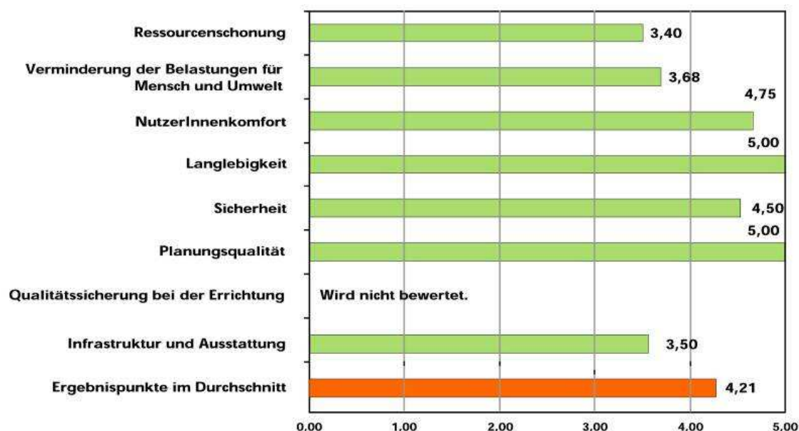
Fig. 2 Results of TQ assessment of project SOL4 in Mödling

The external walls are clay blocks with 30 cm external mineral foam insulation boards respectively 36 cm straw insulation (behind the photovoltaic panels). The U-value of the external walls is 0.11-0.13 W/m 2 K, the energy need for heating is 9.56 kWh/m 2 a. The term “passive solar building” on the whole reflects the objective of making extensive use of the energy resources already available in a building’s basic form and functions, such as the solar gains through windows or casual gains from occupants and equipment, to cover as much of the overall energy demand as possible. Good integration of mechanical and electrical services with passive systems is required to obtain maximum benefit from this