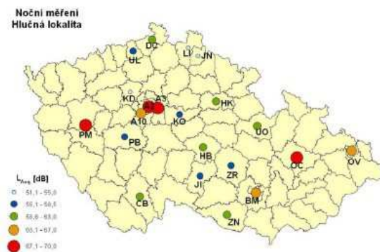
Fig. 2 Night measuring in a noisy area [2]