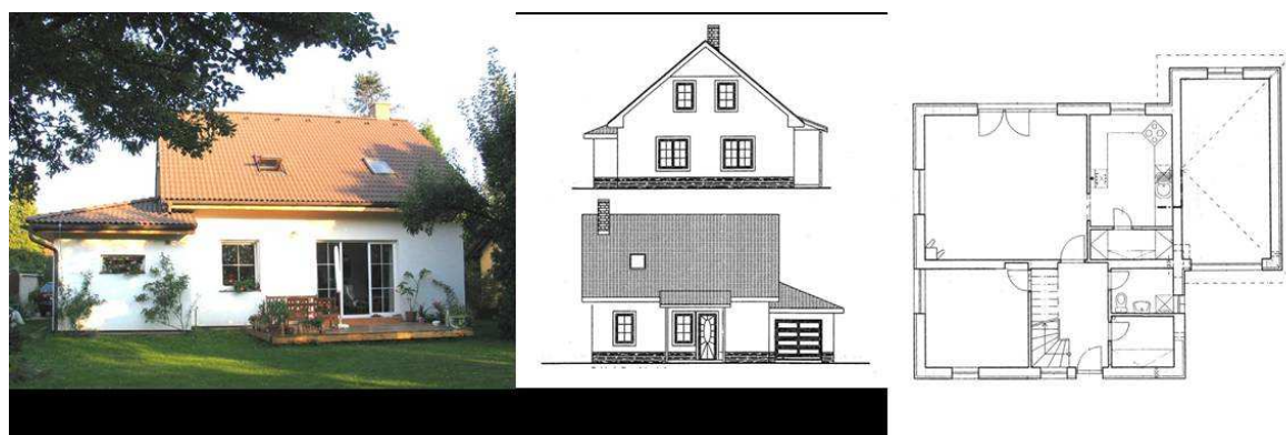
Fig. 1 Views and ground plan of the house

One of the evaluated objects was this family house. It was built in 2000 with investment-costs of 2.45 mil CZK. Even the quality of constructions isn't any bad its specific heat consumption is 183 \text{ kWh} / \text{m}^2 / \text{year} and thermal loss is 9.5 \text{ kW} . High specific consumption is caused by unsuitable object geometric characteristics – the house is quite small and this small capacity is defined by relatively large surface of cooled constructions. In present state this house is being heated by gas boiler.