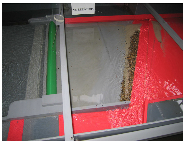
Fig. 2 Test.6 – successful washing away of the suspended load.