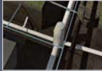
AutoCAD® Civil 3D®

Visualize how everything comes together and improve project collaboration for more predictable outcomes.